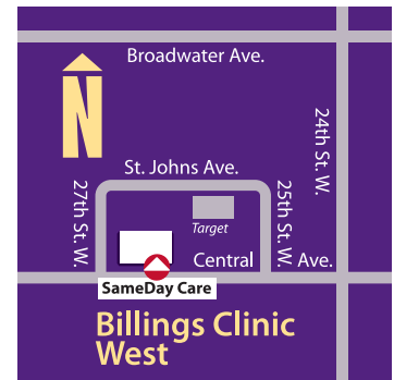
Billings Clinic West * Family Medicine 2675 Central Avenue Lamplighter Square

Medicaid patients, age 21 and older, will have a $5 co-pay. We will file Medicare and Medicaid forms for you.