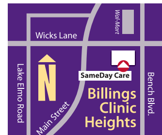
Billings Clinic Heights * Family Medicine 760 Wicks Lane

Children under 9 years of age getting flu vaccine for the first time should get two shots, one month apart.