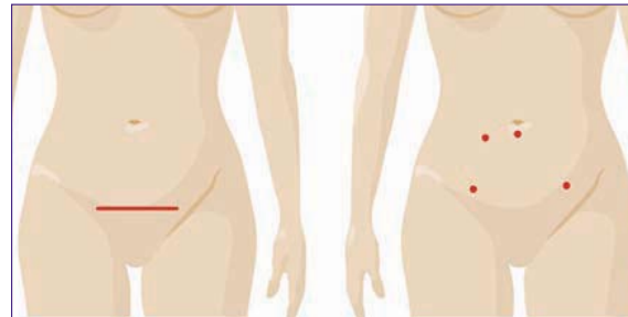
Open Surgery Incision

Another approach, laparoscopic myomectomy, offers a minimally invasive alternative to open surgery but is usually not an option for women with large fibroids, multiple fibroids or with fibroids in difficult-to-reach areas. 5