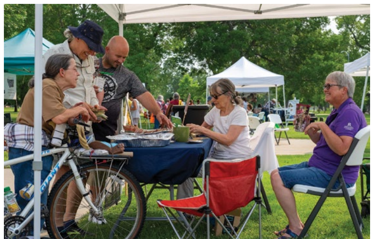
Billings Clinic supports Healthy By Design Coalition's work in Yellowstone County, including the Gardeners' Market at South Park from June-October each year.