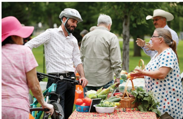
Billings Clinic supports Healthy By Design Coalition's work in Yellowstone County, including the Gardeners' Market at South Park from June-October each year.